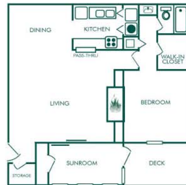
Fernwood 1 Bedroom Flat 988 SF

*Please note: The pictures of the floor plans are general layouts. Depending on the location of the unit, the floor plan may be reversed. Also, some variations may be found in units which have customized their condominium. Square footage may not be exact.