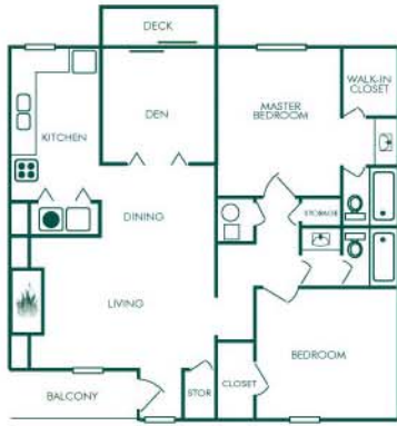
Elmwood 2 Bedroom Flat 1,306 SF