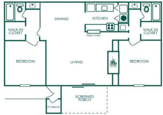
Dogwood 2 Bedroom Roomate 1,158 SF