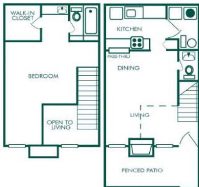
Cedarwood 1 Bedroom Loft 972 SF